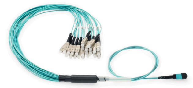
2 mm Furcation